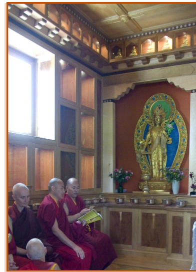
Blessing prayers at the Amitabha Shrine in the Stupa