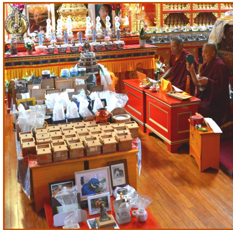
Lamas blessing caskets & tsa-tsa during the 2023 ashes-blessing ceremonies