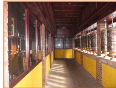
Prayer Wheel Walkway & cabinets

As it is the responsibility of the subscriber to ensure procedures are in place to arrange delivery of the ashes, we will provide you with a certificate and confirmation letter to facilitate this.