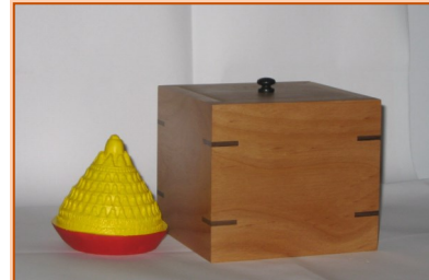
Tsa-tsa and box