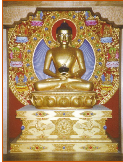
Amitabha statue in the Stupa

In addition, special prayers for the deceased are recited during Kagyu Monlam prayer gatherings.